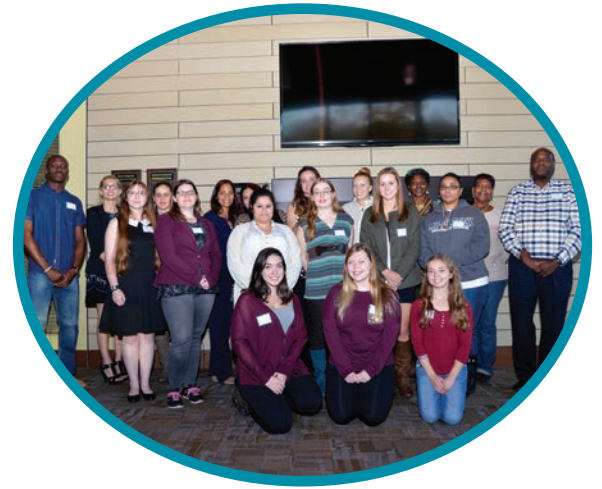
A few of our 2015 Scholarship Recipients pose for the camera