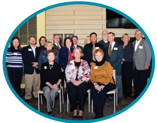
Foundation Board Members snapshot October 2015