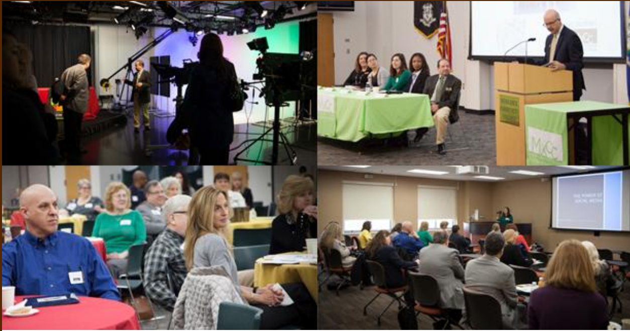
Attendees hear about MxCC's training offerings at the Business Partnership Breakfast on March 29

MxCC Foundation Middlesex Community College Foundation, Inc.