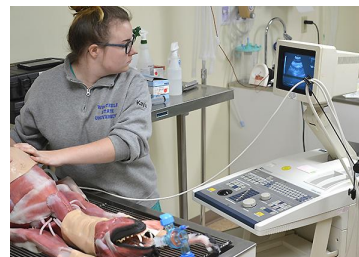
BMS donated an ultrasound system for the vet tech program.

Students in the MxCC veterinary technology program continue to benefit from donations, this time in the form of clinical and laboratory equipment worth almost $30,000 from Bristol-Myers Squibb. The drugmaker recently moved its Wallingford operations out of state and contacted MxCC to see if the equipment would be useful for our students.