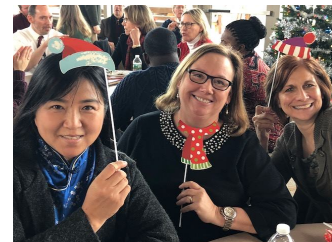
Faculty and staff are ready to serve in 2018.

Middlesex Community College has many reasons to celebrate. In 2018, the college community continues its dedicated work toward the strategic goals of Rebooting Our Advising, Registration, and Retention System; Developing a 21st-Century Marketing Plan; and Declaring Our Academic Identity. The task force for each goal met during the fall semester and presented their findings in a campus-wide meeting prior to the staff holiday party on December 20. For more details on the task forces and their work, visit http://mxcc.edu/strategic-priorities .