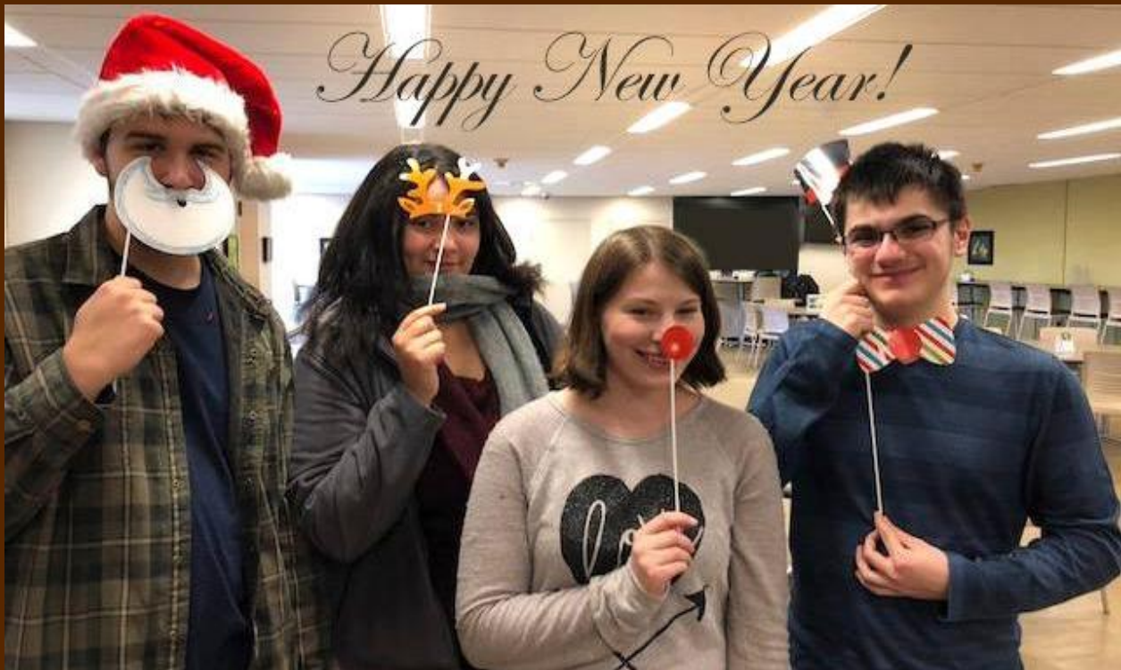
MxCC students clown for the camera

MxCC Foundation Middlesex Community College Foundation, Inc.