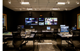
Center for New Media

Look for MxCC Foundation on Amazon Smile