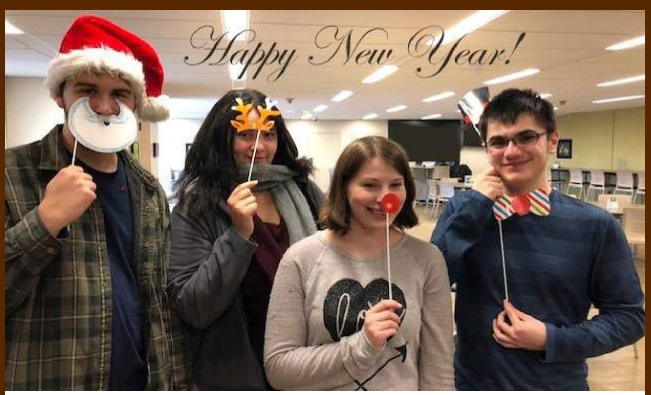
MxCC students clown for the camera