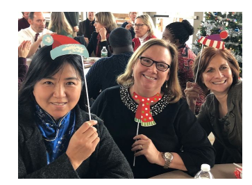
Faculty and staff are ready to serve in 2018.

Middlesex Community College has many reasons to celebrate. In 2018, the college community continues its dedicated work toward the strategic goals of Rebooting Our Advising, Registration, and Retention System; Developing a 21st-Century Marketing Plan; and Dedaring Our Academic Identity. The task force for each goal met during the fall semester and presented their findings in a campus-wide meeting prior to the staff holiday party on December 20. For more details on the task