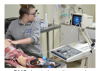
BMS donated an ultrasound system for the vet tech program.

Students in the MxCC veterinary technology program continue to benefit from donations, this time in the form of dinical and laboratory equipment worth almost $30,000 from Bristol-Myers Squibb. The drugmaker recently moved its Wallingford operations out of state and contacted MxCC to see if the equipment would be useful for our students.