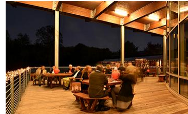
Scenes from the Red Moon Gala

More than 200 individuals attended the gala and raised over $30,000 to support the Foundation's work with MxCC students.