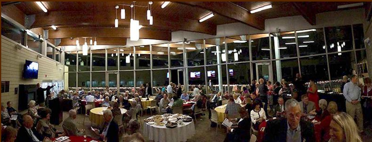
Red Moon Gala 2017