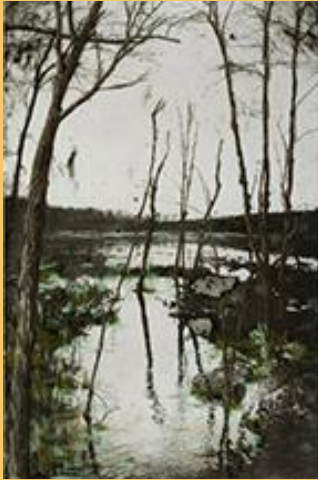
"Pumpkin Hill (1)," pastel on monotype, 2017.

"WHERE I WANDER" Mixed Media by Kathleen Deep November 6 to January 3